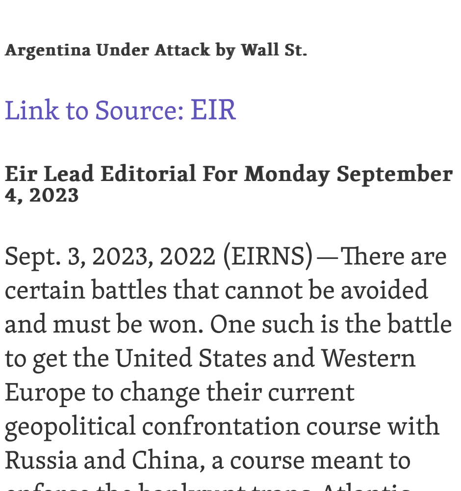
Argentina Under Attack by Wall St.