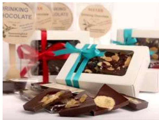
Erica Gilmour's award-winning Hummingbird chocolate.